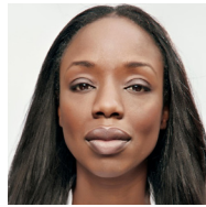
Nadine Burke Harris Center for Youth Wellness